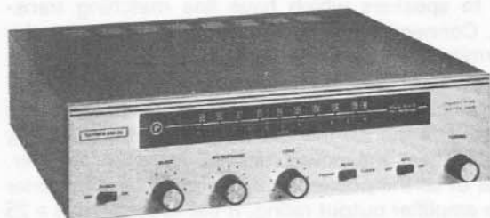
MODEL 840-35A FM RECEIVER

WARNING: TO PREVENT FIRE OR SHOCK HAZARD, DO NOT EXPOSE THIS RECEIVER TO RAIN OR MOISTURE.